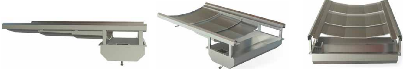
movable plateaus with juice collection pan