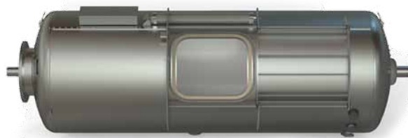
hermetic hatch with pneumatic drive (drum design PST)