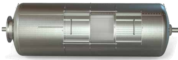
perforated double sliding hatch (drum design PSP)