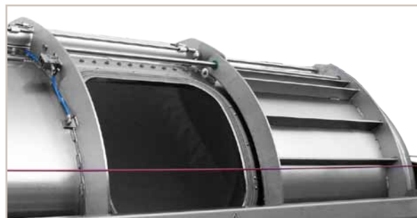
hermetic hatch (drum design PST)