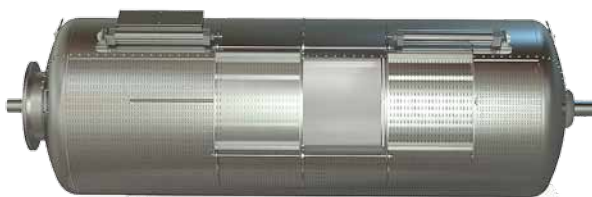
perforated sliding hatch with pneumatic drive (drum design PSP)