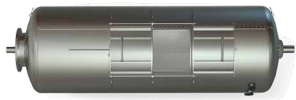
double sliding hatch (drum design PST)