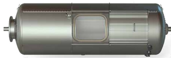
hermetic hatch with manual opening (drum design PST)