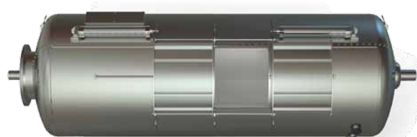
sliding hatch with pneumatic drive (drum design PST)