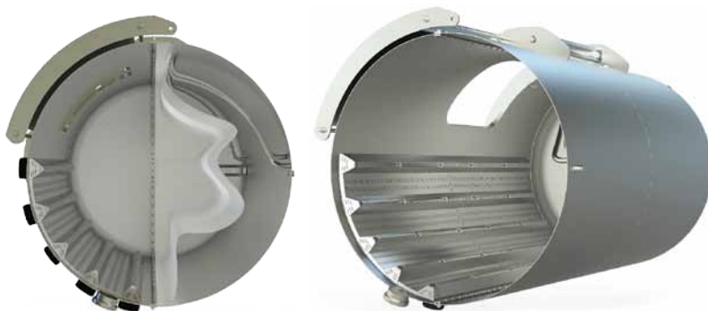
Drum design PST with connected draining channels