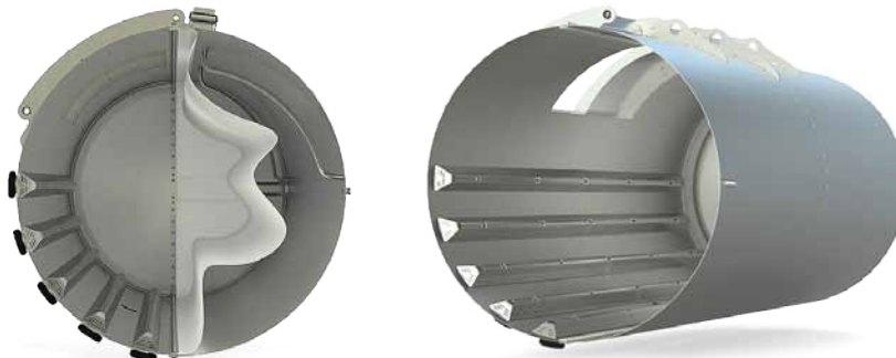
Drum design PST with separate draining channels